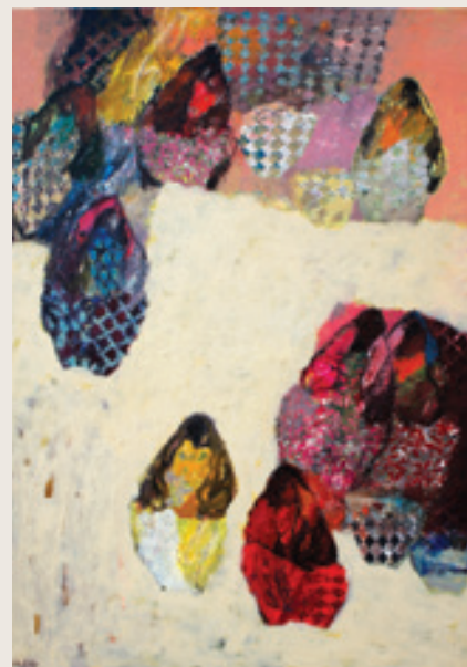
The place 2, 2017, Oil on canvas, 121x91cm