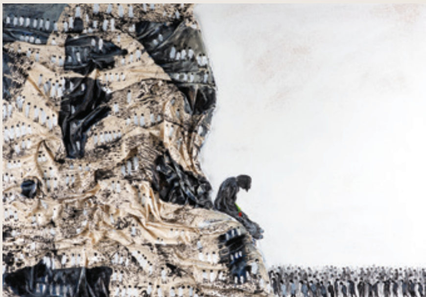
Untitled, 2018, Fabric, Acrylic and Charcoal on Canvas, 70x100cm