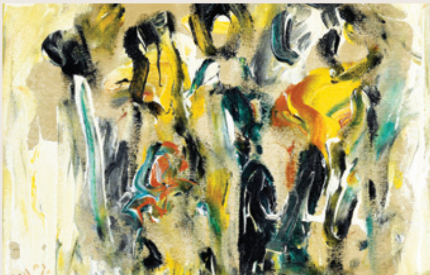
The Beauty Imagination with Colors, 2015, Acrylic on Canvas, 60x45cm