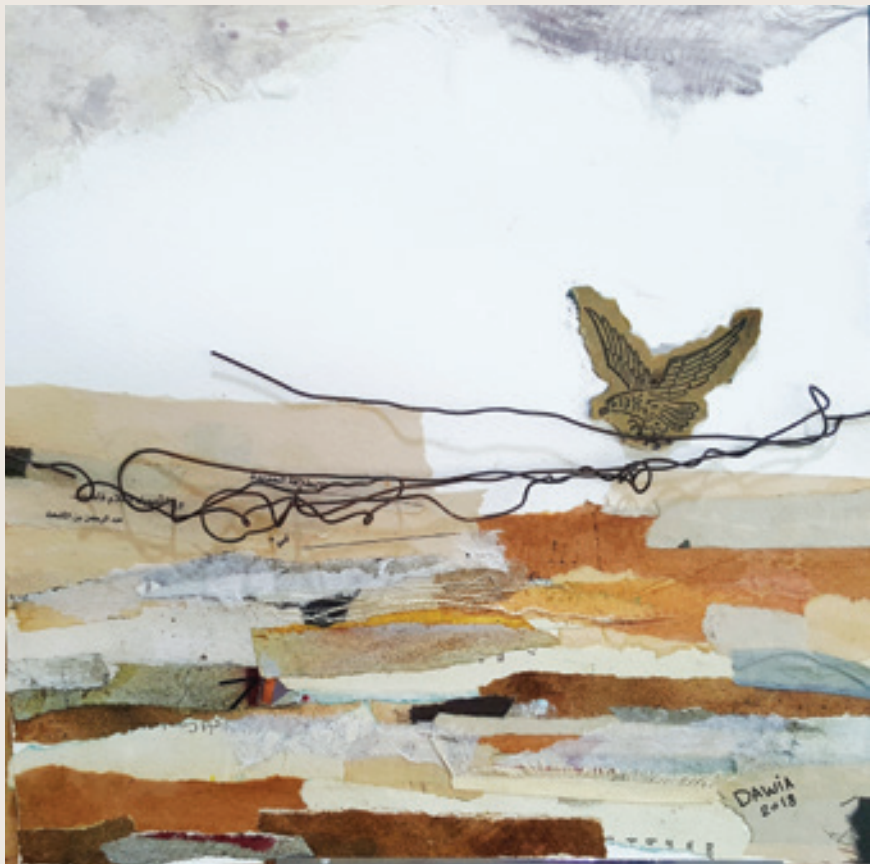
Peaceful, 2018, collage mixed media on paper, 50x50cm