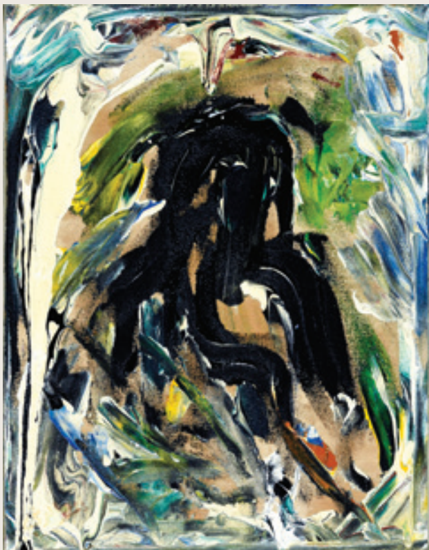
A Colorful Dream in Darkness, 2015, Acrylic on Canvas, 54x46cm,