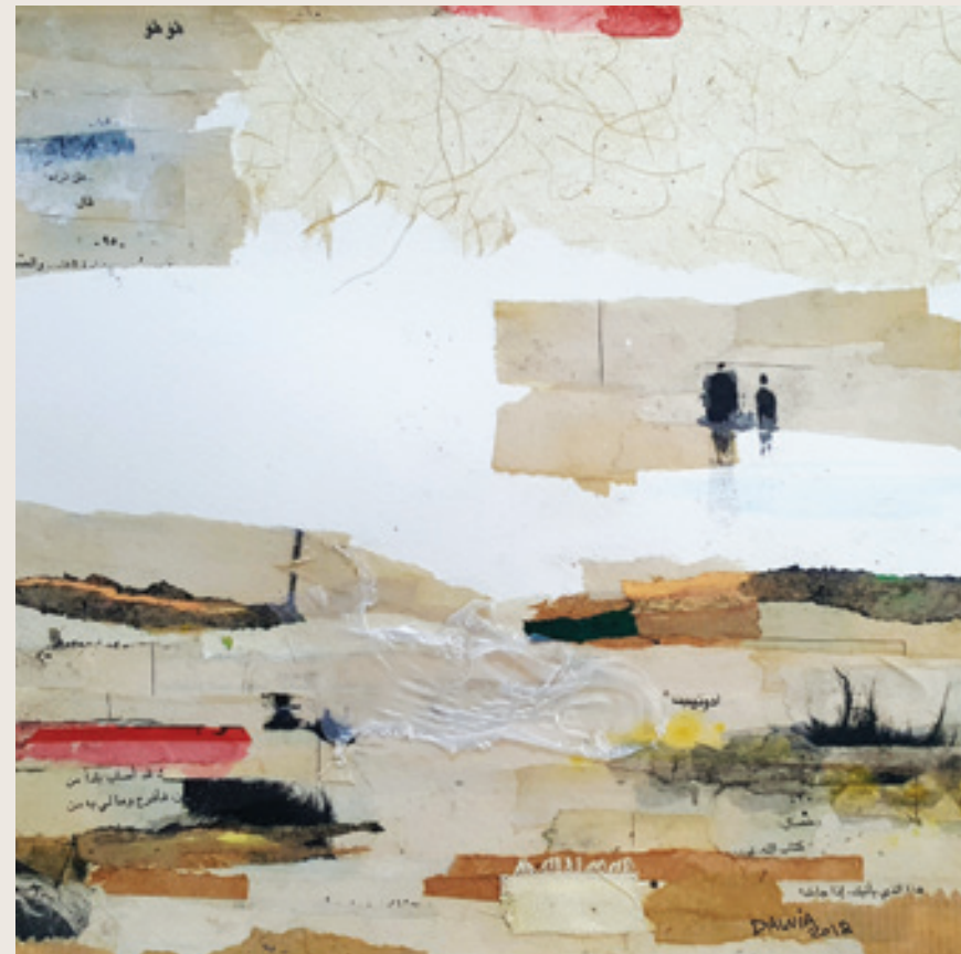
Peaceful 2, 2018, collage mixed media on paper, 50x50cm