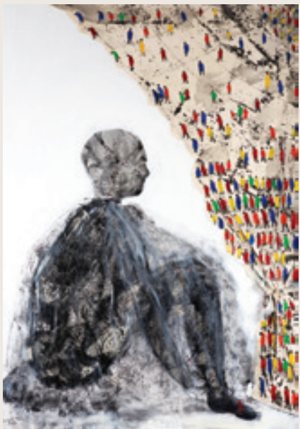
Untitled, 2018, Fabric, Acrylic and Charcoal on Canvas, 70x100cm