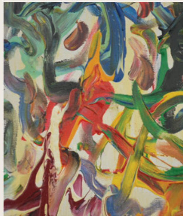
Abstract Variation, 2010 Acrylic On Canvas, 54Cm X 49Cm,