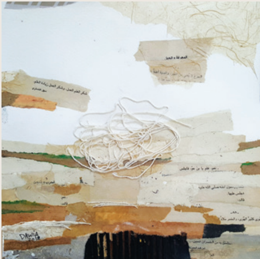
Peaceful 3, 2018, collage mixed media on paper, 50x50cm