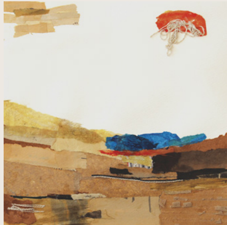
Peaceful 4, 2018, collage mixed media on paper, 50x50cm