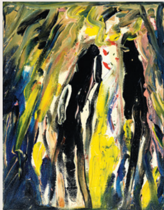
Colors of Time Zones, 2015, Acrylic on Canvas, 57x67cm