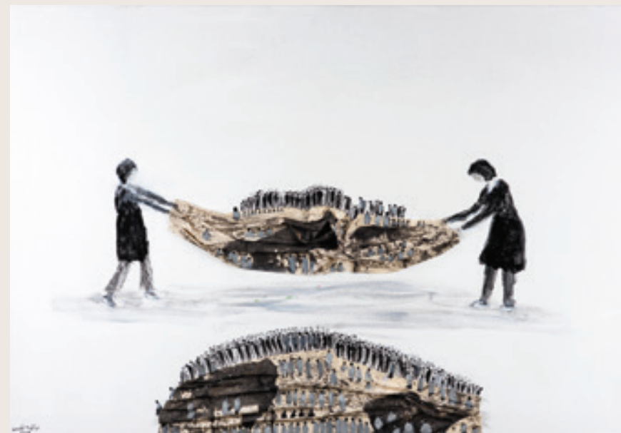
Untitled, 2018, Fabric, Acrylic and Charcoal on Canvas, 70x100cm