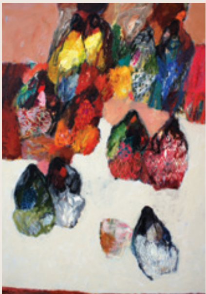
The place 1, 2017, Oil on canvas, 121x91cm