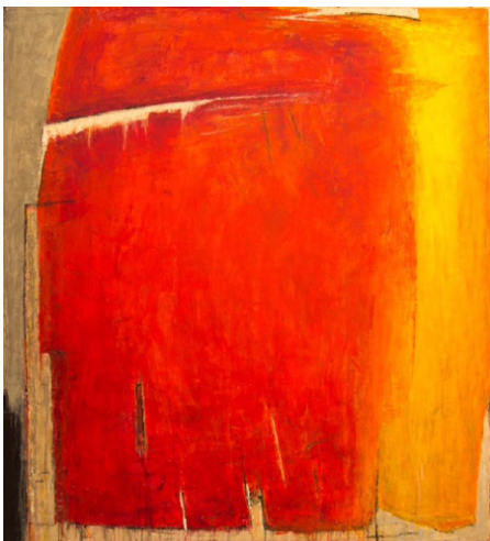
UNTITLED, 2009 ACRYLIC ON CANVAS 130 X 120 CM