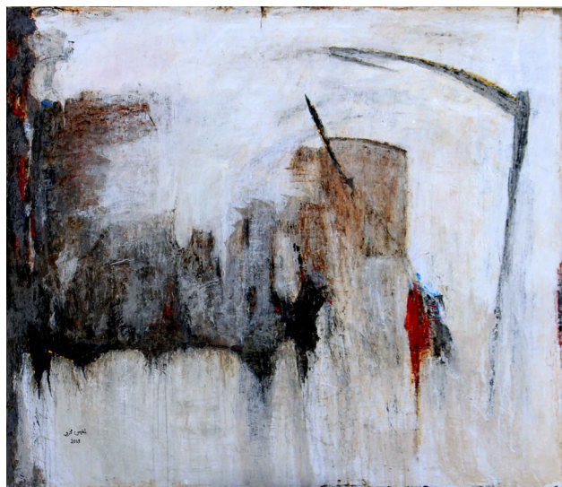
UNTITLED, 2013 ACRYLIC ON CANVAS 120 X 140CM