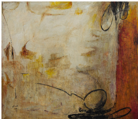
UNTITLED, 2014 ACRYLIC ON CANVAS 120 X 140 CM