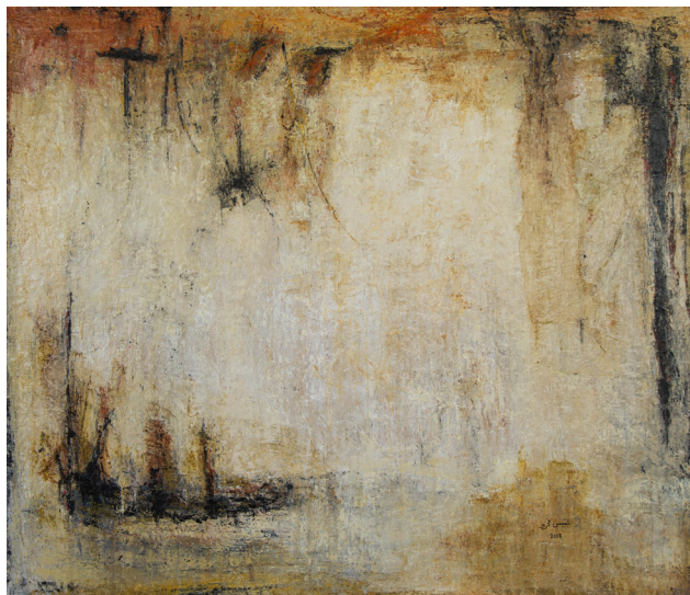
UNTITLED, 2012 ACRYLIC ON CANVAS 120 X 140 CM