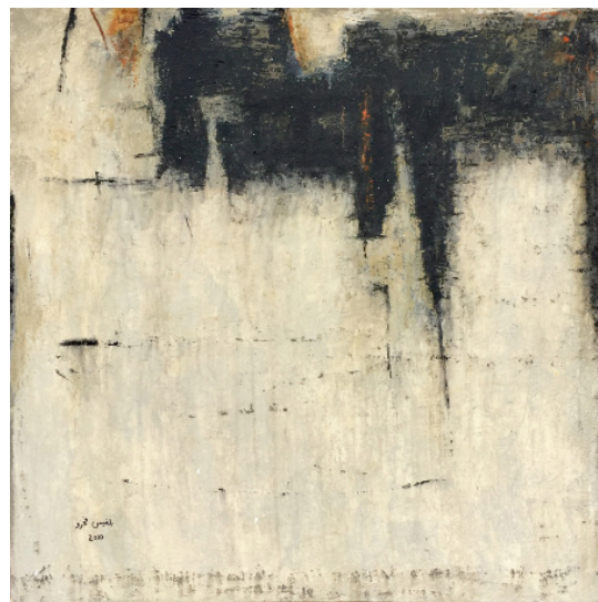
UNTITLED, 2010 ACRYLIC ON CANVAS 80 X 80 CM