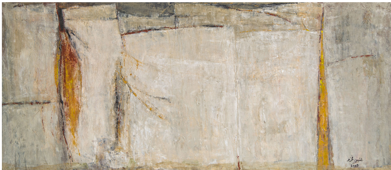
UNTITLED, 2009 ACRYLIC ON CANVAS 53 X 134CM