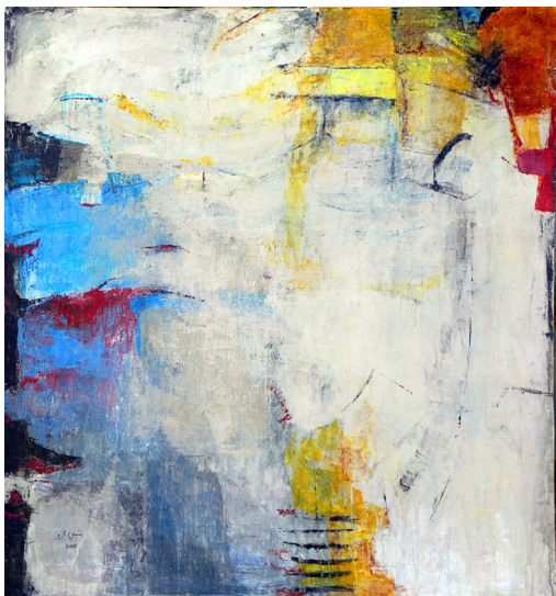
UNTITLED, 2015 ACRYLIC ON CANVAS 130 X 120 CM