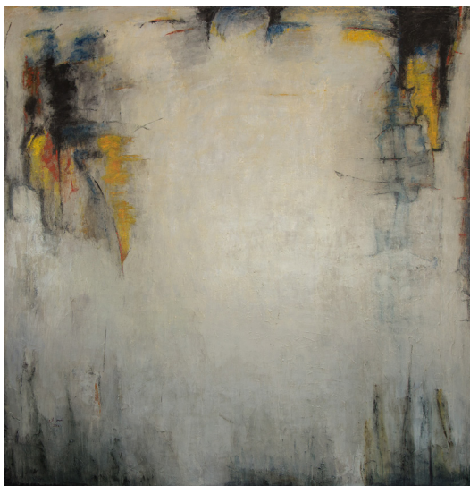
UNTITLED, 2016 ACRYLIC ON CANVAS 200 X 200 CM