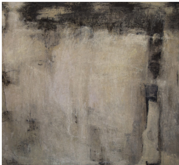
UNTITLED, 2015 ACRYLIC ON CANVAS 120 X 130 CM