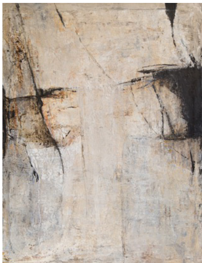
UNTITLED, 2006 ACRYLIC ON CANVAS 80 X 60 CM