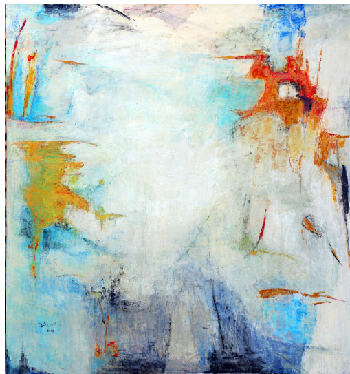
UNTITLED, 2015 ACRYLIC ON CANVAS 130 X 120CM