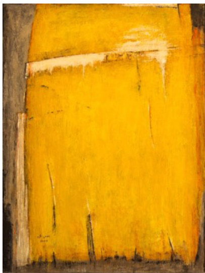
UNTITLED, 2009 ACRYLIC ON CANVAS 120 X 90 CM