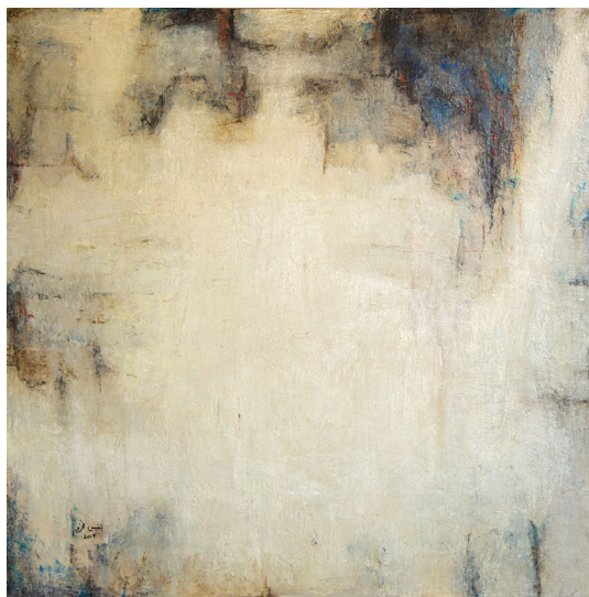
UNTITLED, 2017 ACRYLIC ON CANVAS 100 X 100CM