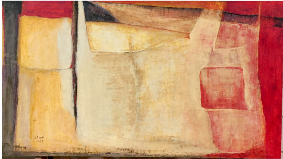
UNTITLED, 2009 ACRYLIC ON CANVAS 160 X 90 CM