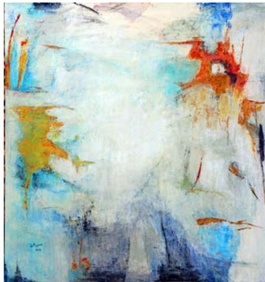
Balqees Fakhro Untitled, 2015 Acrylic on Canvas 130x120cm

I like to show the high contrast between light and dark, and as a technique, I like to use texture to give it more complexity. My monochrome color scheme gives my paintings a dream-like quality, and a sense of vagueness. This allows the viewer to interpret the painting and make sense of it according to his or her own background."