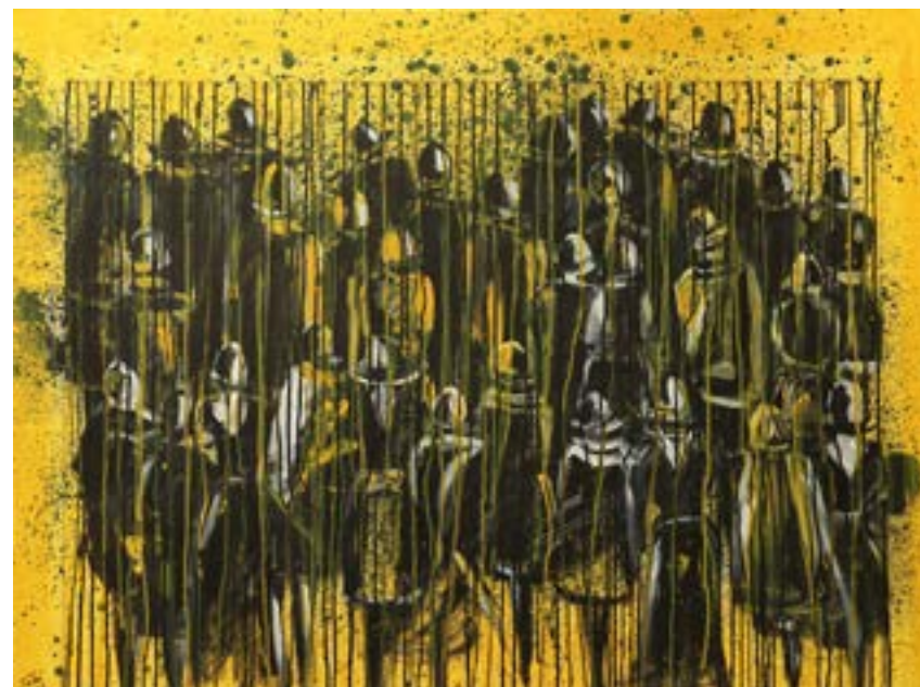
Mohammed Taha The only color that matters: Yellow, 2017 Acrylic on Canvas 101x91cm

I don't set out to produce art about one subject or another. I'm never without a sketchbook to hand so I am constantly drawing and sometimes the drawings are left in the sketchbook and other times they develop into more in-depth ideas and detailed images. My influences are first and foremost everything I see, feel and experience. I am very much influenced by modern art as well as older artists such as Van Gogh, Rembrandt and Picasso. Paying attention to every detail in my work to translate the meaning and feeling of each."