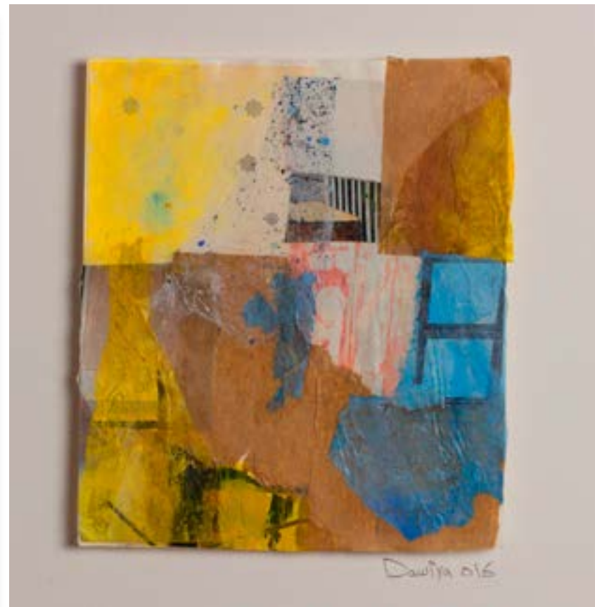
Dawiya Al Alaweyyat Euphoria 2, 2016 Collage and Mixed Media on Fine Art Paper 45x45cm