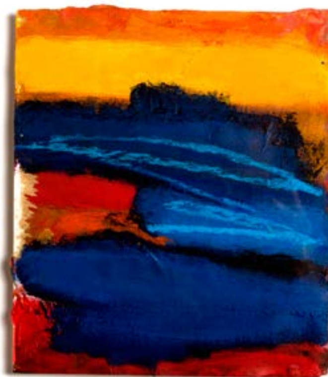
Dawiya Al Alawiyat Euphoria 4, 2016 Collage and Mixed Media on Fine Art Paper 45x45cm

My art technique is based on the use of different materials, pastes, paper, textile and sand. as well as being influenced by art produced the artwork of the feel of a major impact on my soul which increases my passion to walk in this way.