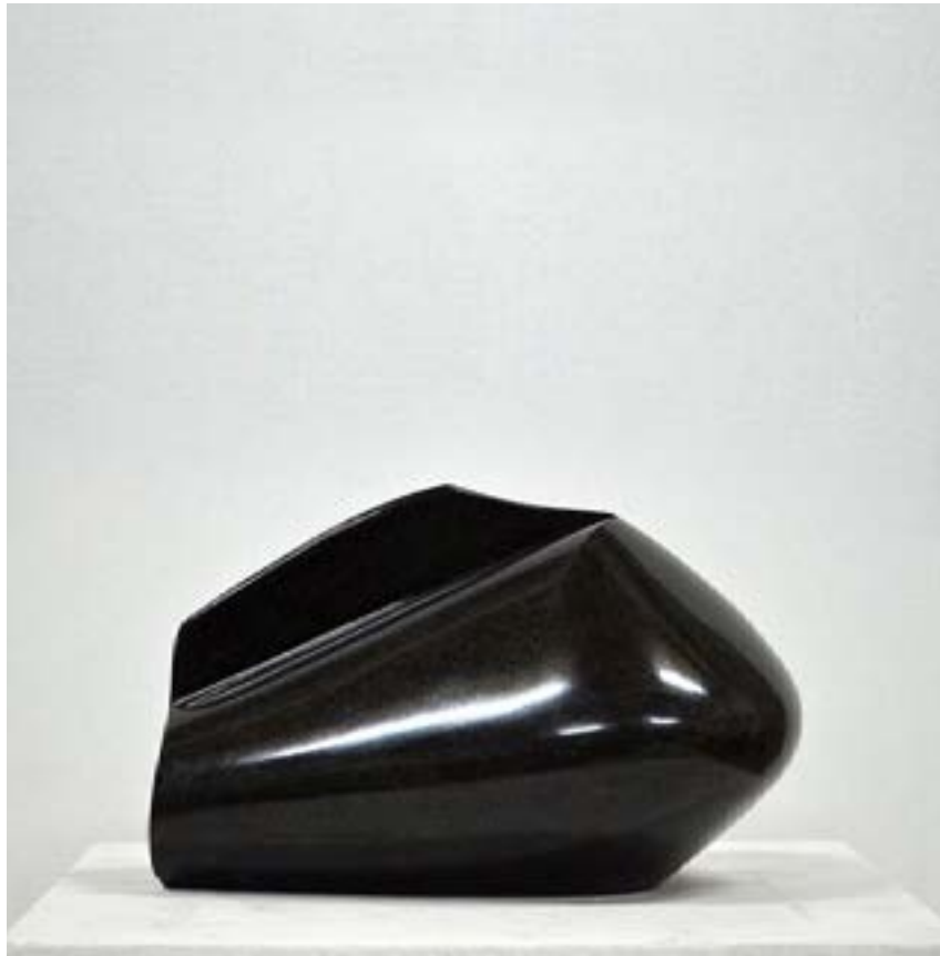
Jamal Abdulrahim Bird Composition, 2016 Double black Granite 21 x 22 x 17