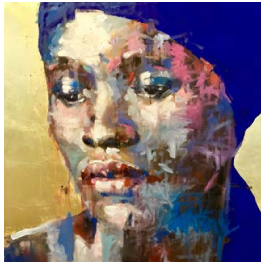
Jamal Abdulrahim Portrait, 2017 Oil on Canvas and gold leaf 100 x 100cm