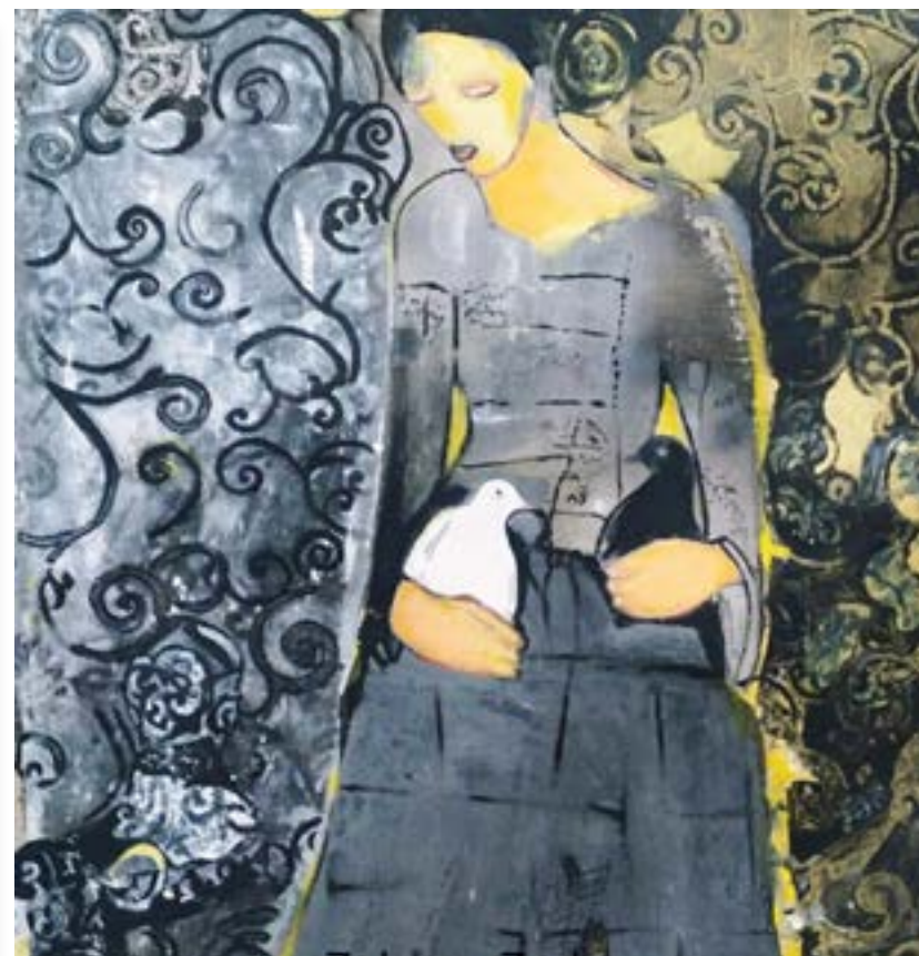
Zakeya Zada My Hope is Found 1, 2017 Mixed Media on Canvas 100 x 120 cm