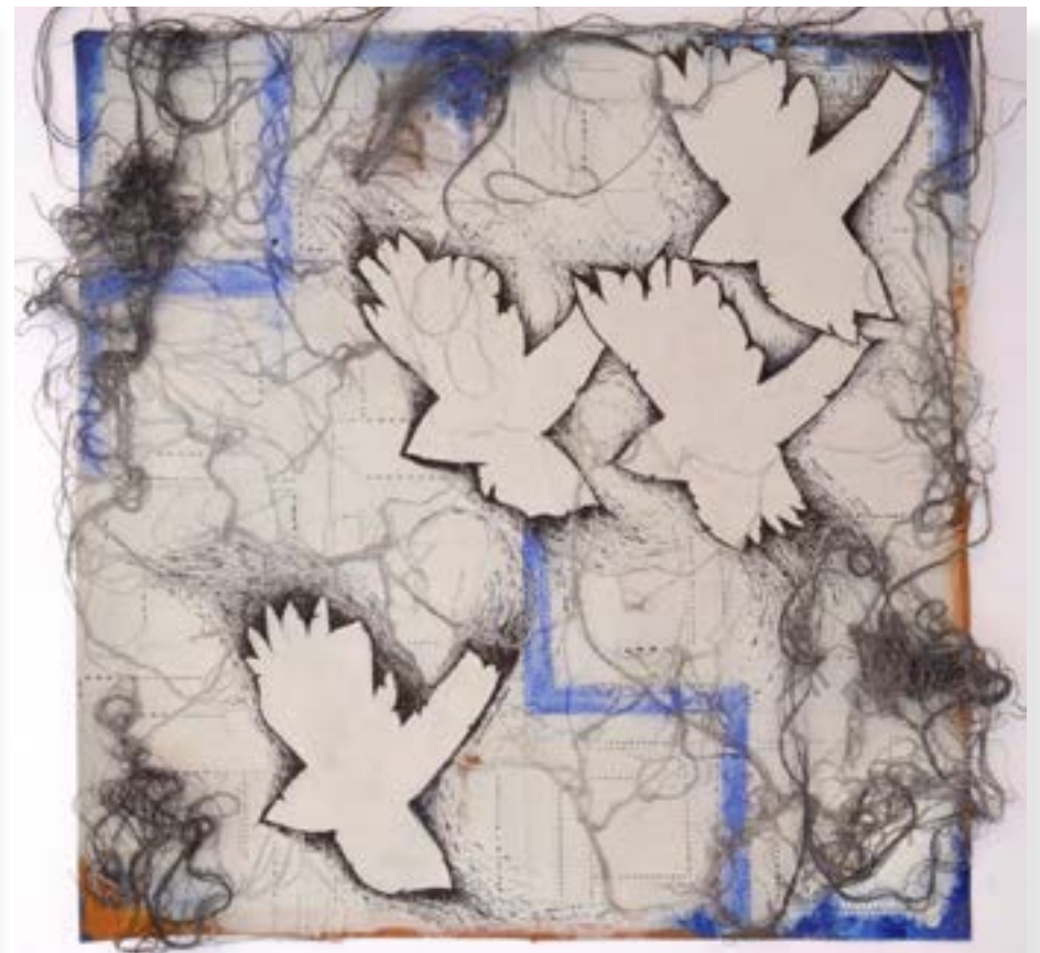
Somaya Abdulghani Iqra, 2017 Mixed Media on Fine Paper 70x70cm