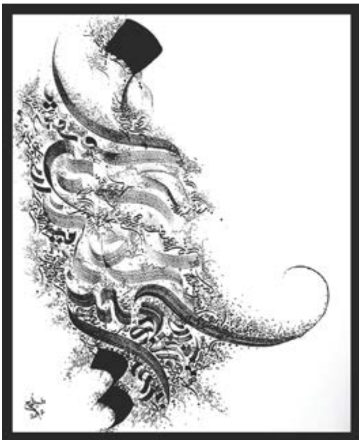
Taiba Faraj Letters Dance 2, 2017 Mixed Media on Canvas 120x100 cm