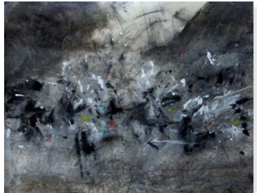
Hamed Al Bosta Untitled, 2015 Mixed Media on Paper 55x70cm

The Black & White is the major pallets is used by Albosta colors withier it's Charcoal or pencil and other material.