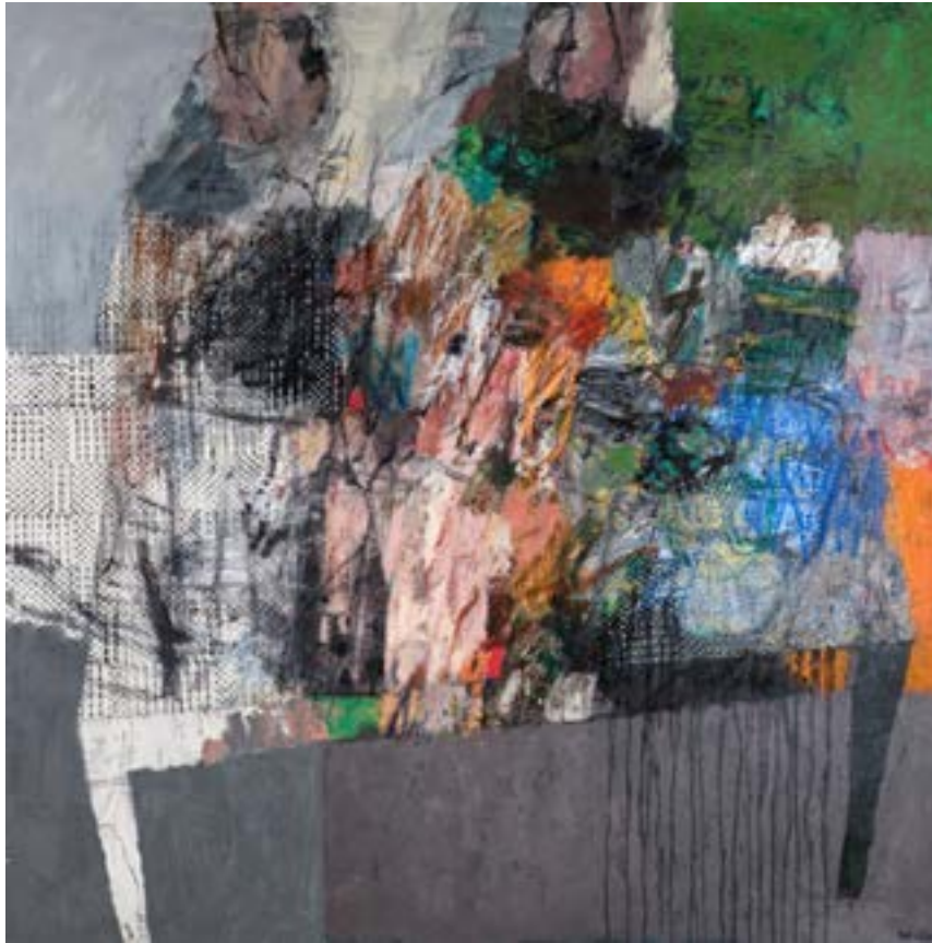
Omar Al Rashid Untitled, 2015 Oil on Canvas 150x150cm