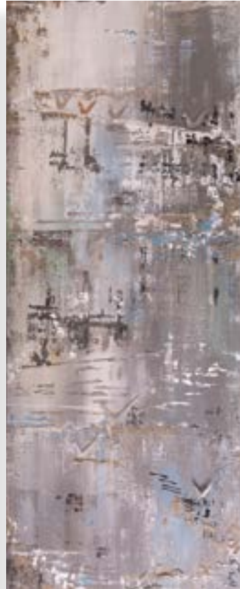
Maryam Nass Duplicate Dreams, 2017 Acrylic on Canvas 200 X 80 cm each