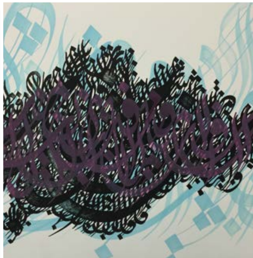
Ayman Jaafar Life 2, 2017 Acrylic on Canvas 100x100cm