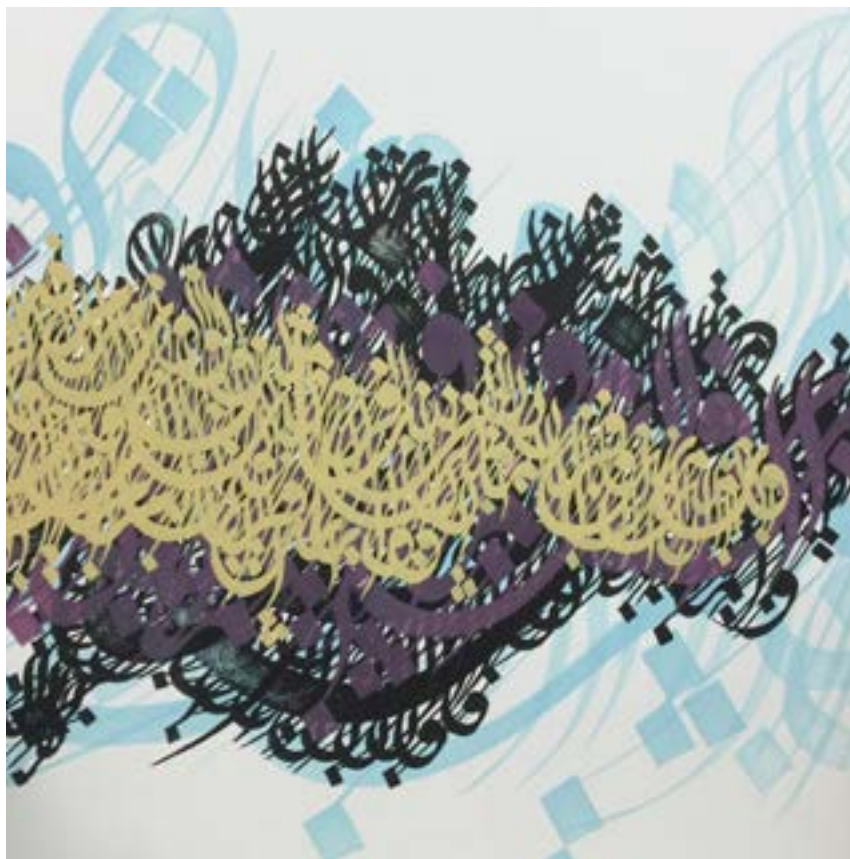
Ayman Jaafar Soul 1, 2017 Acrylic on Canvas 100x100 cm