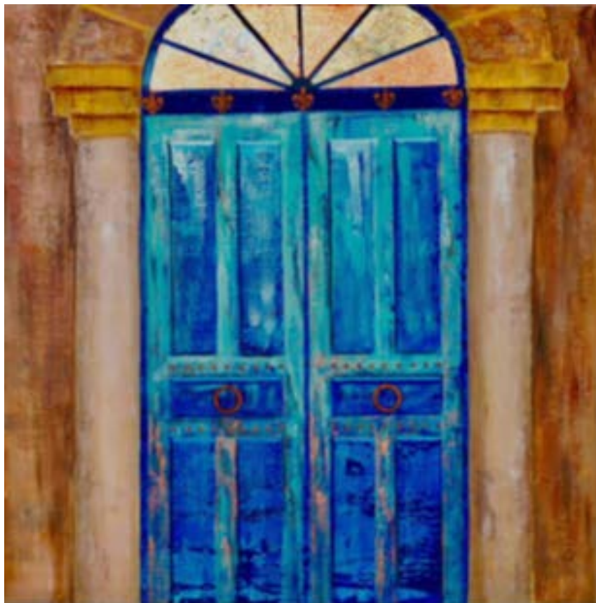
Karina Al Zu'bi Behind each door there is a story 1, 2017 Mixed Media 140x140cm