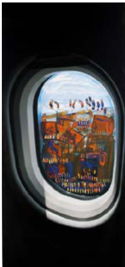
Faiqa Al Hassan Wanderings 1, 2014 Mixed Media on Canvas 158x69cm