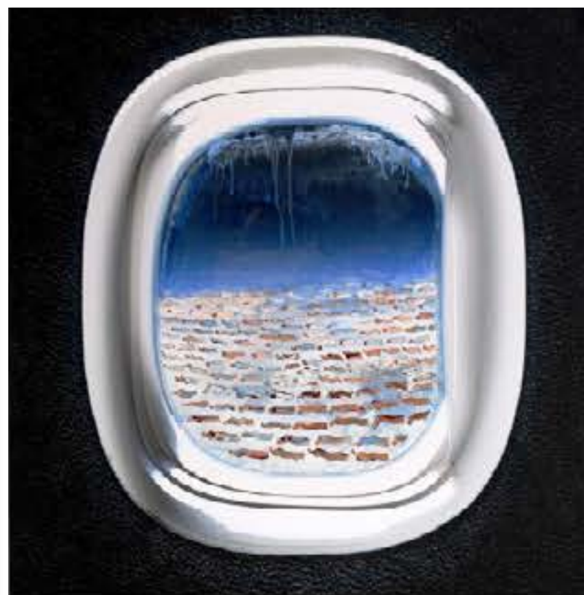
Faiqa Al Hassan Wanderings 2, 2014 Mixed Media on Canvas 60x80cm