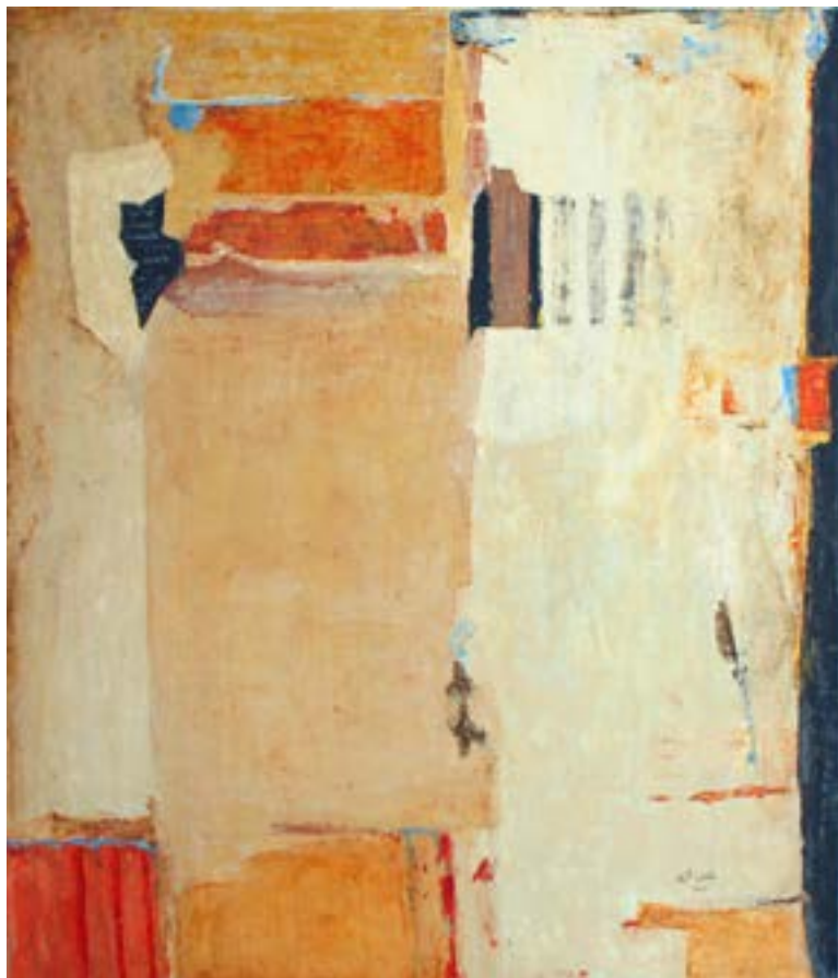
Balqees Fakhro Untitled, 2012 Acrylic on Canvas 140x120cm