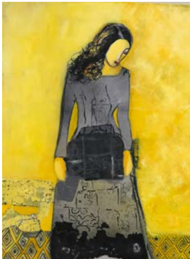
Zakeya Zada My Hope is Found 1, 2017 Mixed Media on Canvas 100 x 120 cm