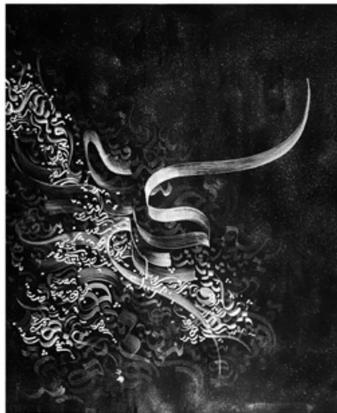
Taiba Faraj Love 2, 2017 Mixed Media on Canvas 120x100cm