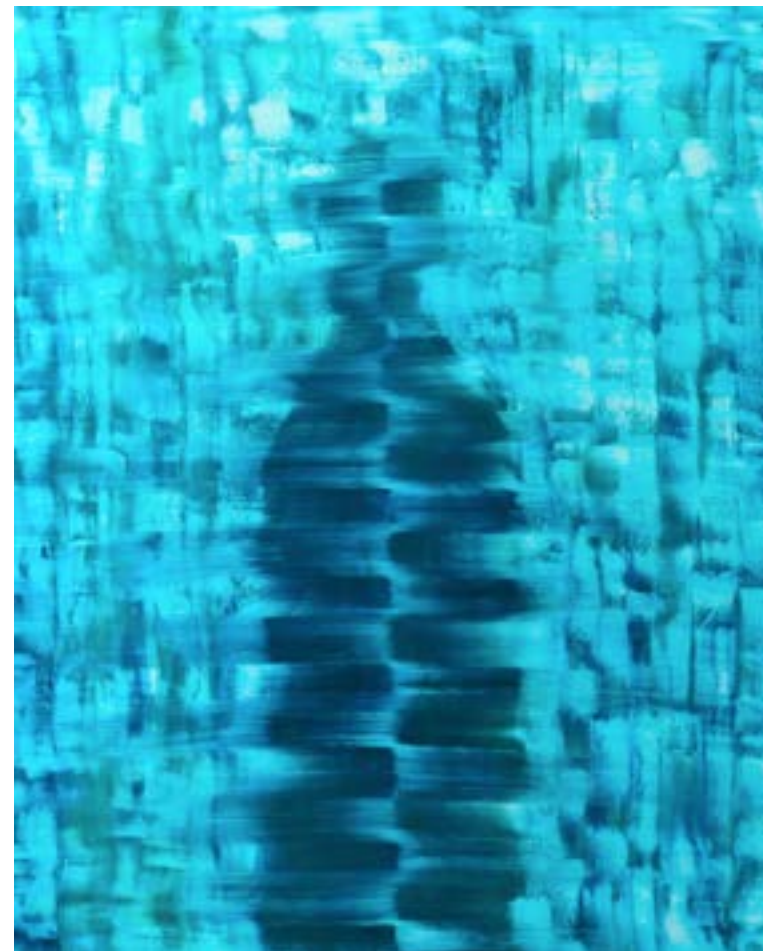
Lulwa bint Abdulaziz Al Khalifa Schism 4, 2017 Oil on Canvas 150x100cm

"I don't complicate my process at all, I just stand in front of the canvas and paint," she says. "I like the raw energy that produces on the canvas. Each painting is a journey of discovery that starts from an inspiration. That inspiration could literally be anything. I don't question that inspiration, I just go with it. I have never feared a blank canvas because I view it as an exciting possibility and I look forward to the outcome."