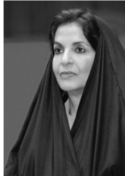
Her Royal Highness Princess Sabeeka Bint Ibrahim Al Khalifa Wife of the King of Bahrain President of the Supreme Council for Women

Under the patronage of Her Royal Highness Princess Sabeeka bint Ibrahim Al Khalifa, Wife of the King of Bahrain and President of the Supreme Council for Women, Art Bahrain Across Borders (ArtBAB), is an art program connecting the artist's of Bahrain on a global platform. The ambitious project, now in its second edition, aims to solidify Bahrain's position as a regional arts and education hub whilst stimulating investment and economic activity in the arts and cultural sector