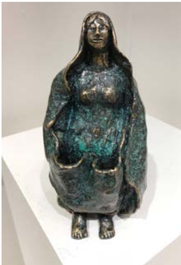
Mariam Fakhro Bahraini Woman, 2016 Bronze 20x10x10cm