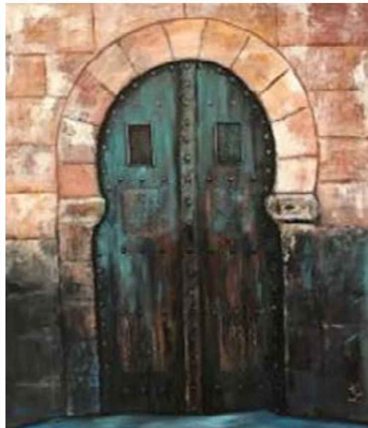
Karina Al Zu'bi Behind each door there is a story 3, 2017 Mixed Media 140x140cm