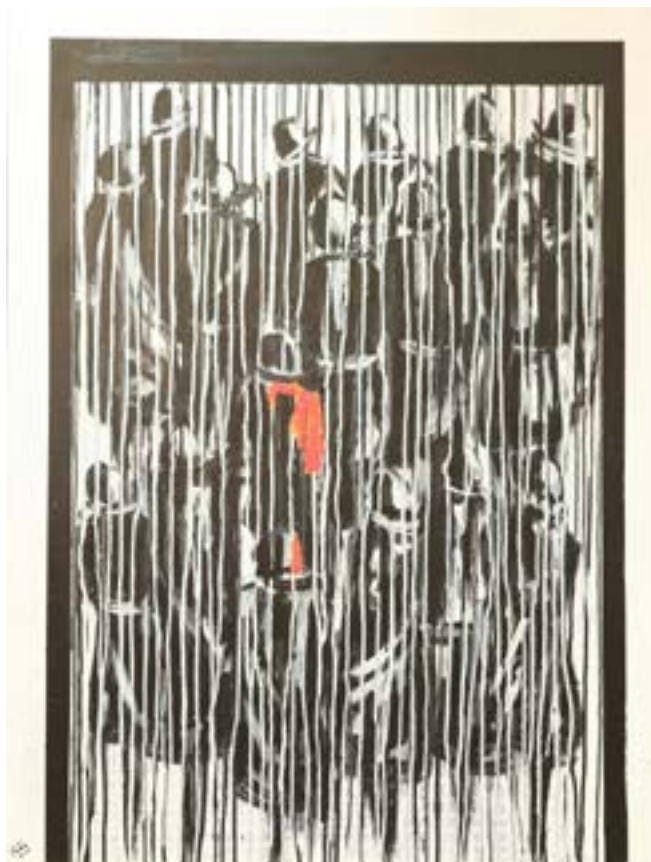
Mohammed Taha Crowd, 2017 Acrylic on Canvas 122x91cm