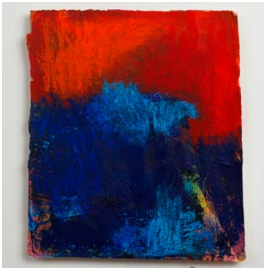
Dawiya Al Alaweyyat Euphoria 3, 2016 Collage and Mixed Media on Fine Art Paper 45x45cm