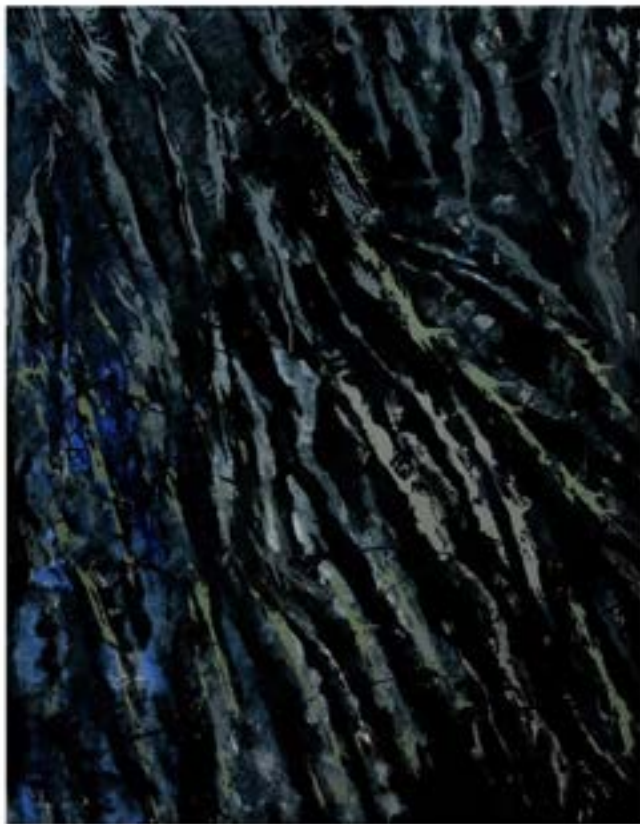
Nabeela Al Khayer Water II, 2017 Mixed Media on Canvas 140 x 180 x 84 cm