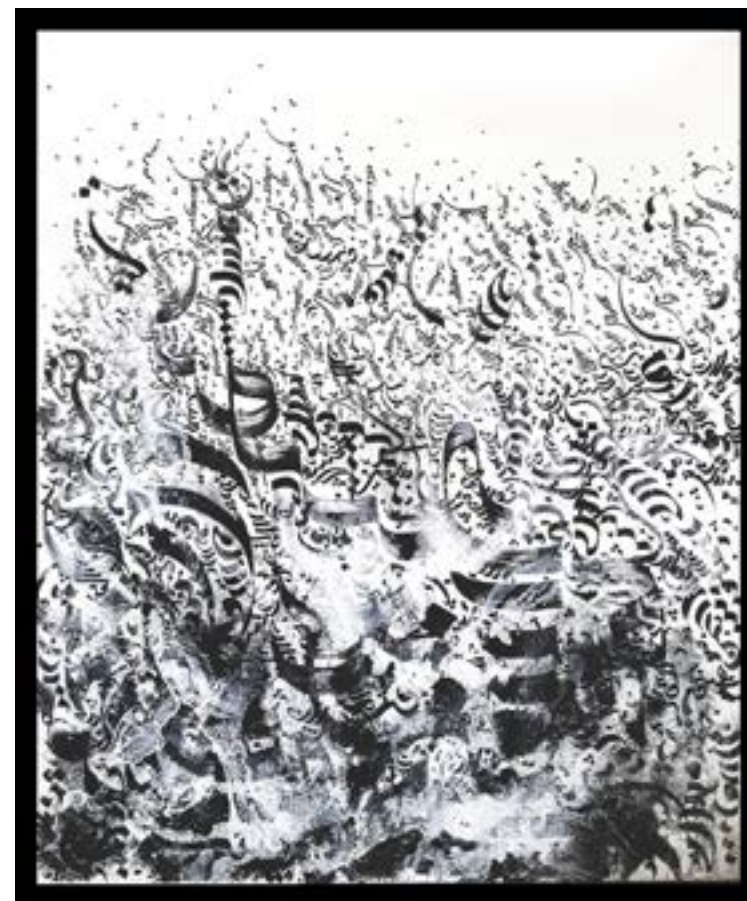
Taiba Faraj Letters Dance 1, 2017 Mixed Media on Canvas 120x100 cm

Her current ambition is to develop a new script.