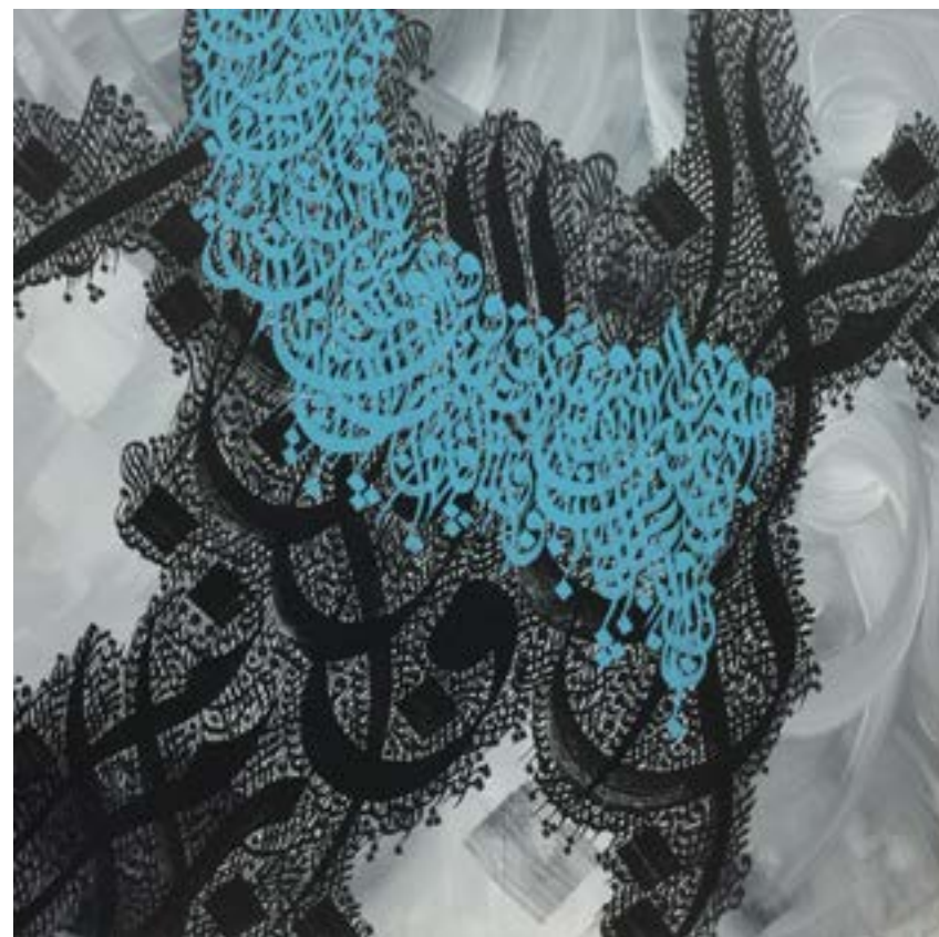
Ayman Jaafar Life 1, 2017 Acrylic on Canvas 100x100 cm

My travel in the world of Arabic letters, in all their meanings and connotations in the Arab and Islamic culture, opened up the world of abstraction and mysticism. I try to document the biography of this intensely poetic moment through these letters...."