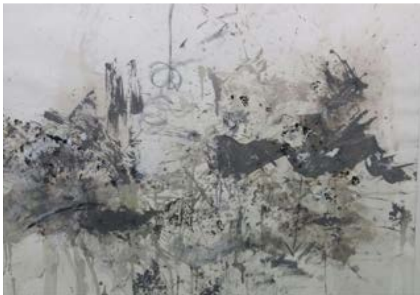
Hamed Al Bosta Untitled, 2015 Mixed Media on Paper 55x70cm