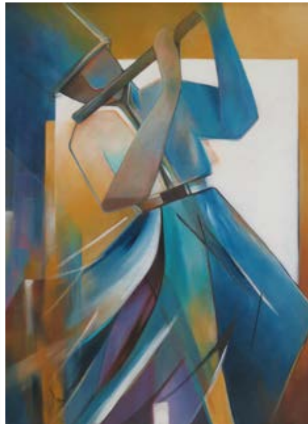
Seema Baqi Sing, 2017 Mixed Media on Canvas 100x70cm