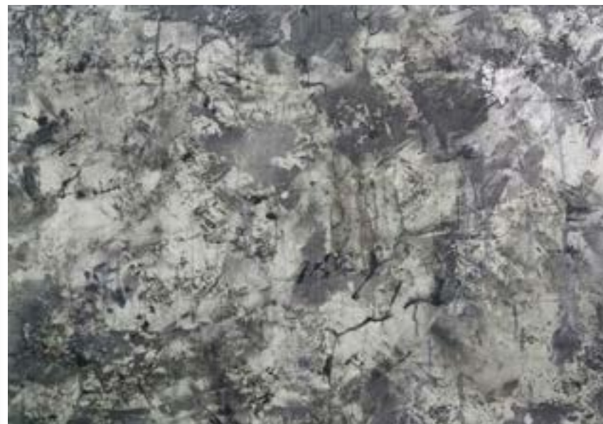
Hamed Al Bosta Untitled, 2015 Mixed Media on Paper 55x70cm