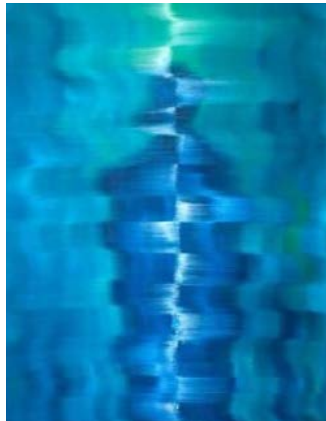
Lulwa bint Abdulaziz Al Khalifa Dhow, YEAR MATERIAL SIZE