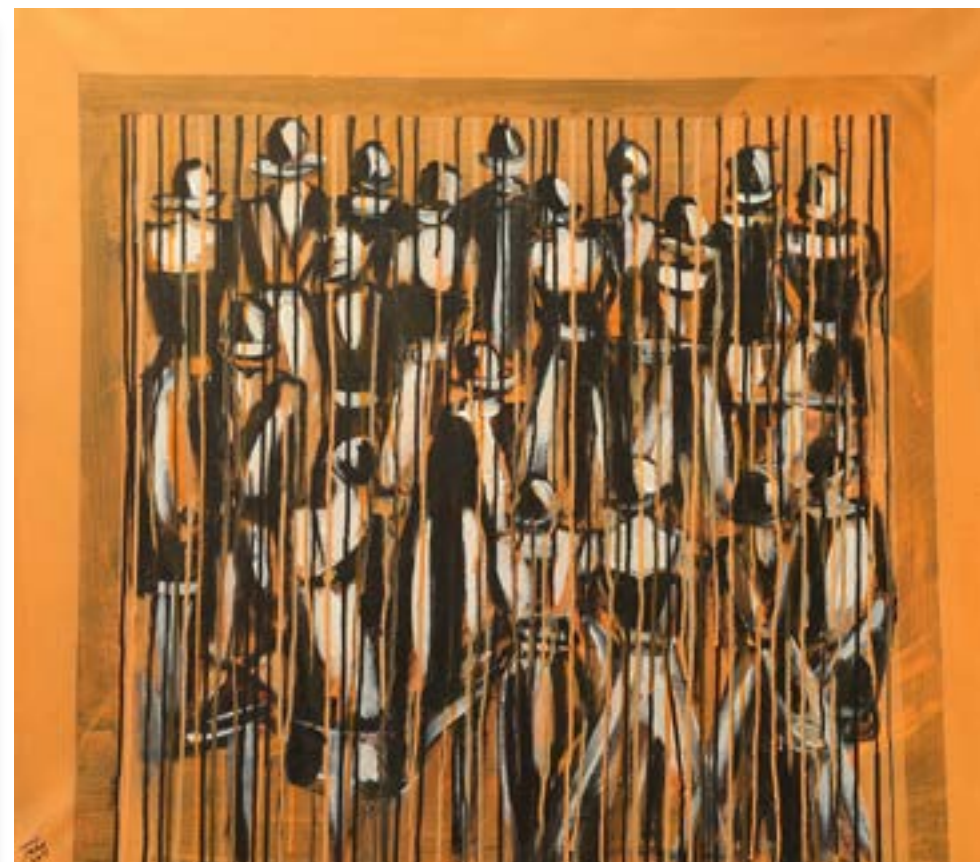
Mohammed Taha Modern Ladies, 2017 Acrylic on Canvas 101x91cm