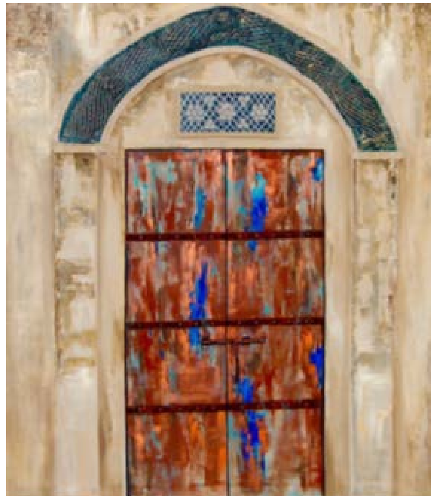
Karina Al Zu'bi Behind each door there is a story 2, 2017 Mixed Media 140x140cm

opened their doors to each other some 5000 years ago, tracing their origins to the period of the Dilmun Civilization in Bahrain to the era of Indus valley civilization in India. Ancient Bahraini traders traded in Bahraini pearls while Indian merchants traded in Indian spices.