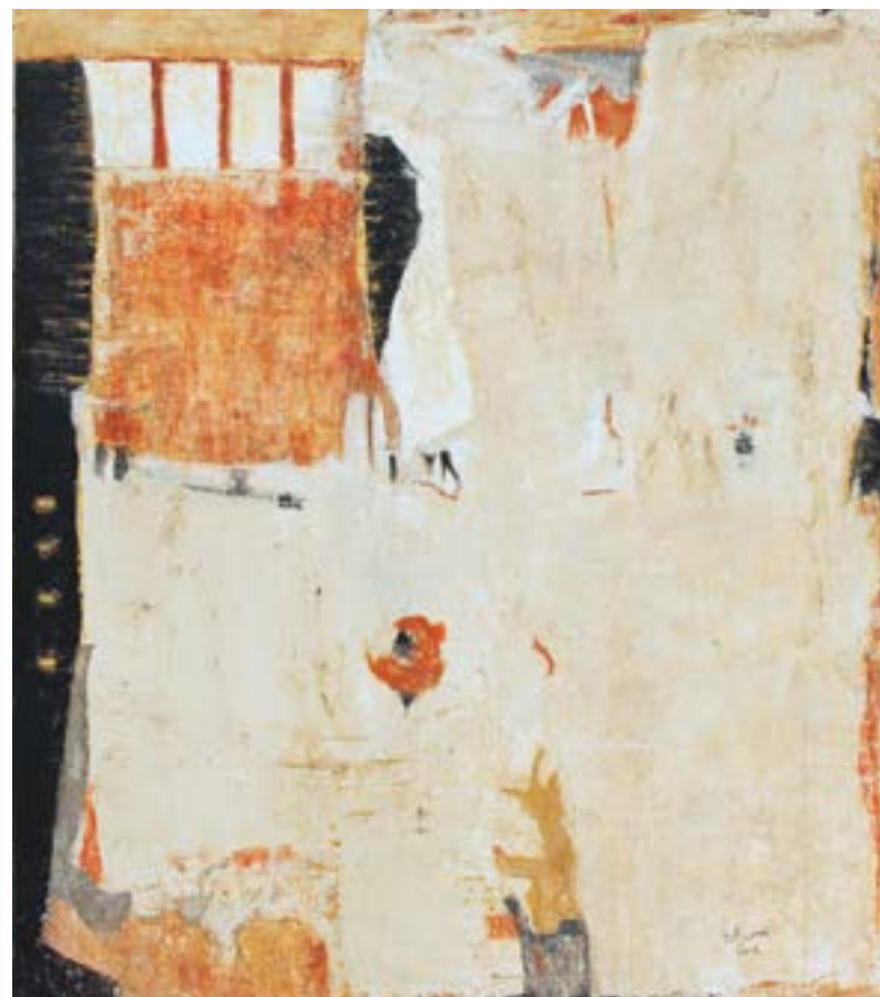
Balqees Fakhro Untitled, 2012 Acrylic on Canvas 140x120cm