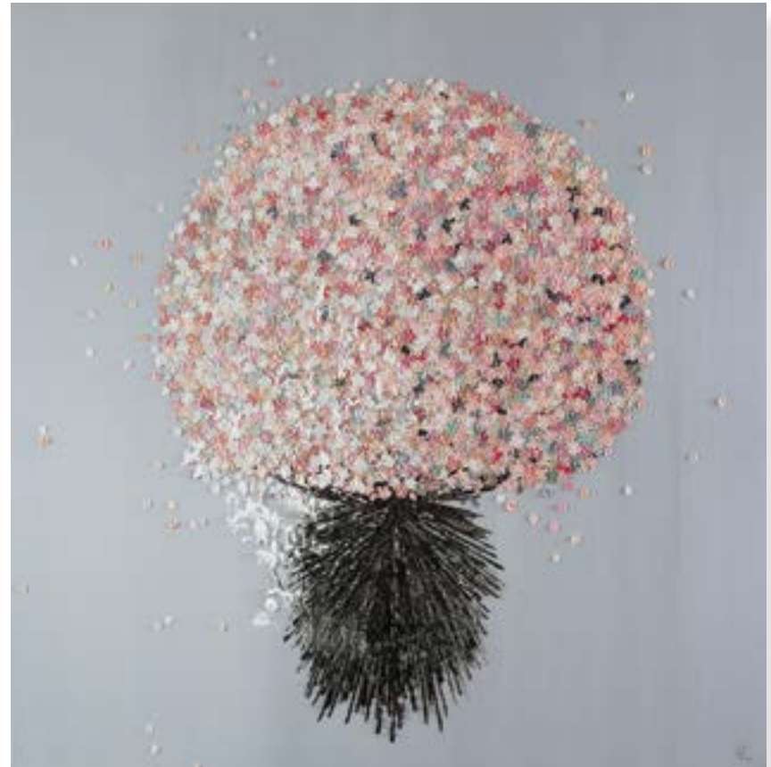
Maryam Nass Finally, 2017 Oil on Canvas 120 X 120 cm