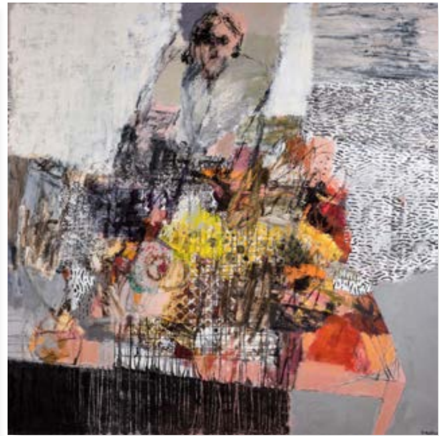
Omar Al Rashid Untitled, 2016 Oil on Canvas 150x150cm