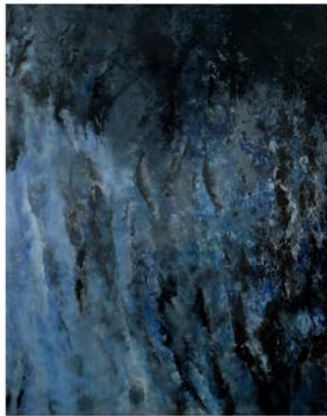
Nabeela Al Khayer Water, 2017 Mixed Media on Canvas 140 x 180 x 84 cm