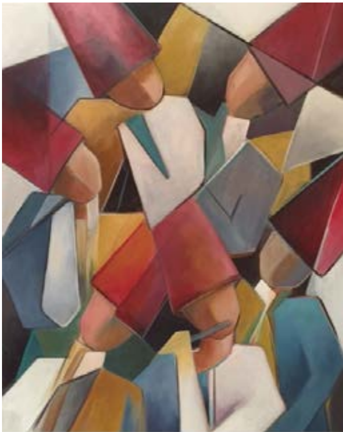
Seema Baqi Rise, 2017 Mixed Media on Canvas 95 x 120 cm