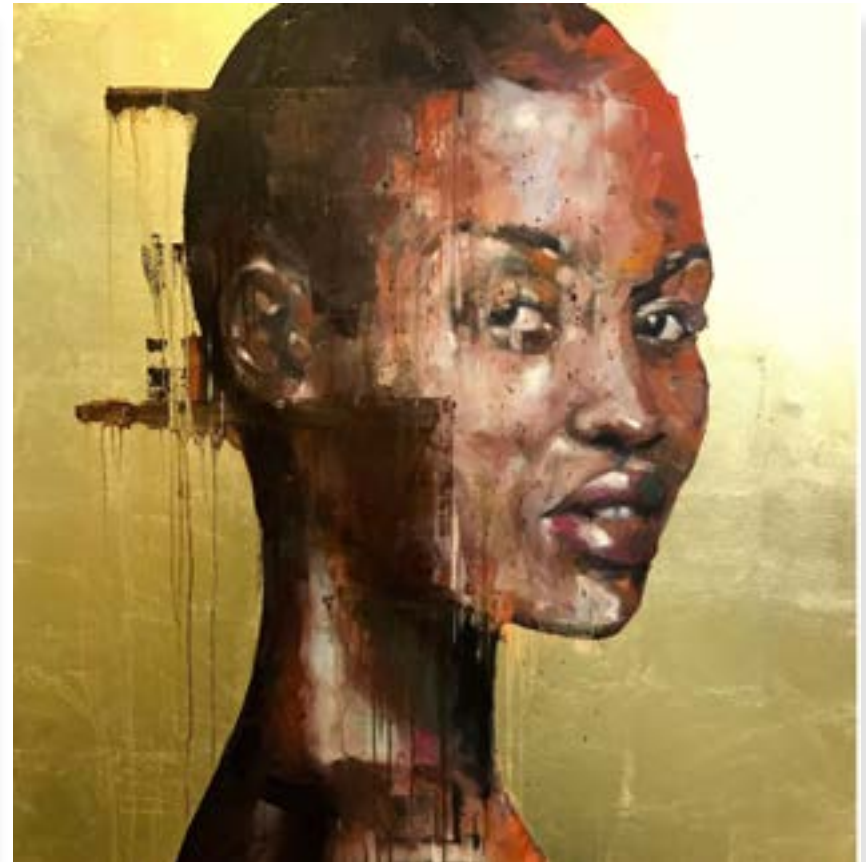
Jamal Abdulrahim Portrait, 2017 Oil on Canvas and gold leaf 100 x 100cm